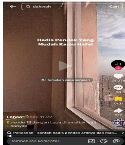
Figure 2. @Lanaa

ﷺ. Instead, the phrase is more accurately categorised as mahfūzāt, namely expressions or words of wisdom that developed in the oral traditions of Arab society rather than authentic sayings of the Prophet.